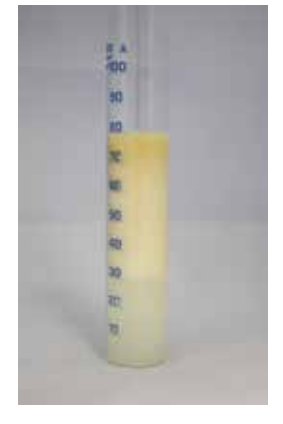
Good separability Easy to remove